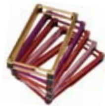
Red, Black, Silver, Polished Gold, Pink, Purple, Orange, Chrome, 24K Gold, White.