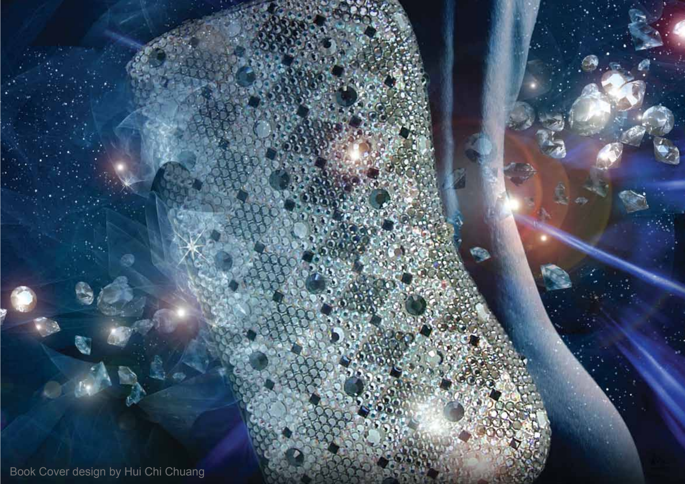
Book Cover design by Hui Chi Chuang